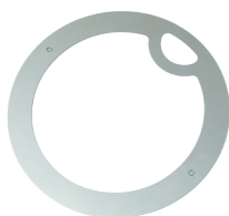
Ceiling mount base